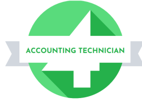
Level 4 Accounting Technician