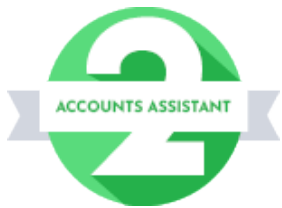
Level 2 Accounts Assistant